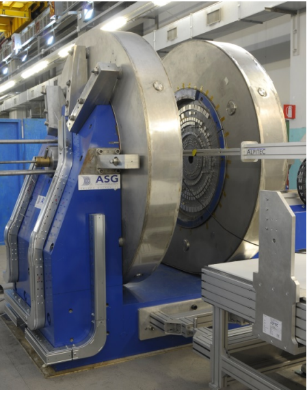
Iron yoke with vacuum chambers